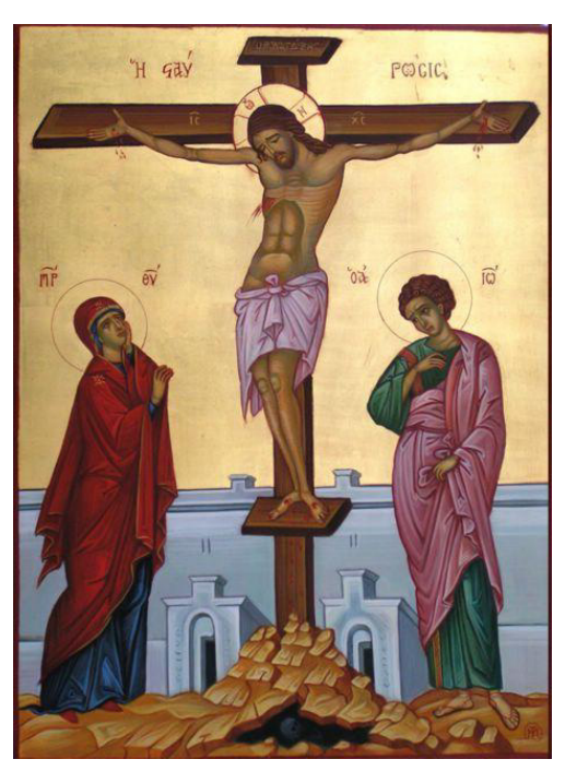
Icon "The Standing of the Mother of God at the Cross"

Received 11.12.2017, received in revised form 26.01.2018, accepted 06.02.2018