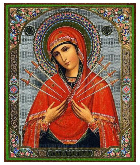
Fig. 1. The Icon of the Mother of God of Seven Blades

On the Great Saturday, instead of the Cherubic Hymn, Let All Human Flesh be Silent ... and instead of Axion Estin..., the irmos of the