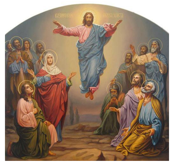
Fig. 3. Icon of the Ascension of the Lord

All the parts of the cantata Stabat Mater start with orchestral episodes that, in general, represent a separate symphony in the genre of