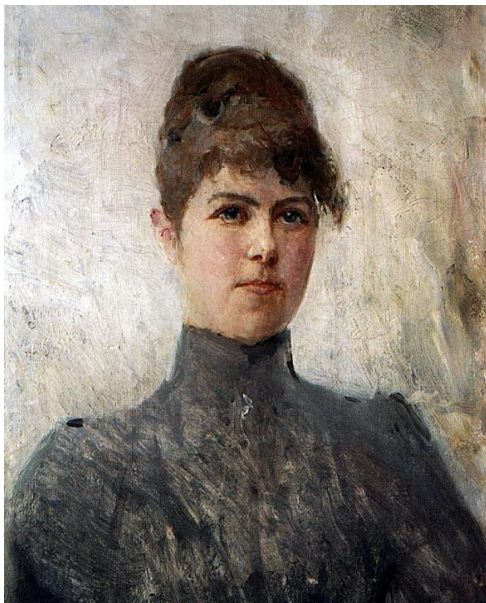
Fig. 4. V.A. Serov. Portrait of Marie Yakovlevna van Zandt. 1886. Samara Art Museum

At the same time when d'Andrade brothers came to Mamontov's theatre, Marie van Zandt (1861-1919) was invited to Mamontov's private opera. A brilliant coloratura soprano and charming appearance favoured performances in theatres of Italy, France, England and Russia in the leading roles of Zerlina in "Don Giovanni" by W. Mozart, Marguerite in "Faust", Juliet in "Romeo and Juliet" by S. Gounod, Ophelia in "Hamlet", Mignon in "Mignon" by Sh. Tom, Dinora by J. Meyerbeer. The composer Leo Delibes wrote the opera "Lakme" for Marie van Zandt taking into account her natural background and her knowledge of the theoretical French singing school.