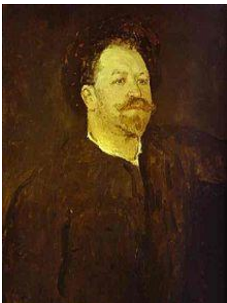
Fig. 6. V. Serov. The portrait of Francesco Tamagno. 1891. The State Tretyakov Gallery

Serov heard Tamagno in Venice, in Moscow, and on the order of Mamontov painted the portrait,