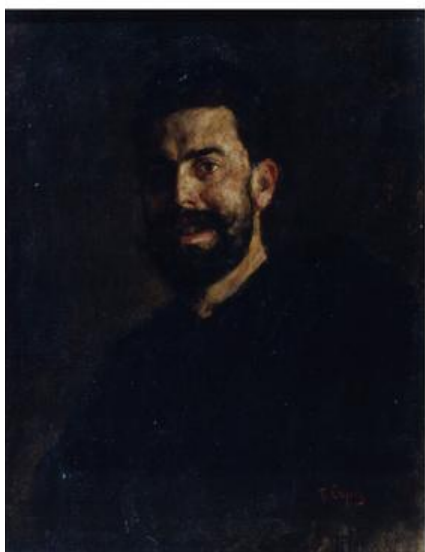
Fig. 2. V.A. Serov. The portrait of the singer Antonio d'Andrade. 1885. Sumy regional art museum named after N. Onatsky