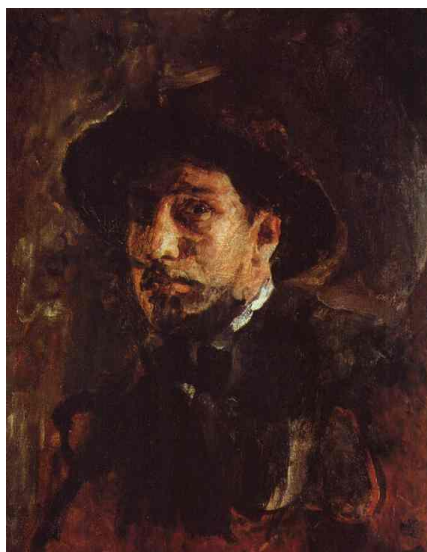
Fig. 3. V.A. Serov. Self-portrait. 1885. Private collection

Fernand in “La favorite”, Gennaro in “Lucrezia Borgia” by Gaetano Donizetti, the Duke in “Rigoletto”, Radames in “Aida” by G. Verdi, Don Jose in “Carmen” by J. Bizet, Faust in the opera of the same name by S. Gounod, etc. Since the middle of the 19 th century there had been transformations in the vocal art of Italy. Giuseppe Verdi’s school of composers united previous achievements and developed common principles of music art. The artistic level required emotional impact on the viewer with the integrity of the music, libretto, vocal and expert features of the singer, so that the “mezzo-soprano was a great artist” (Verdi, 1973: 193).