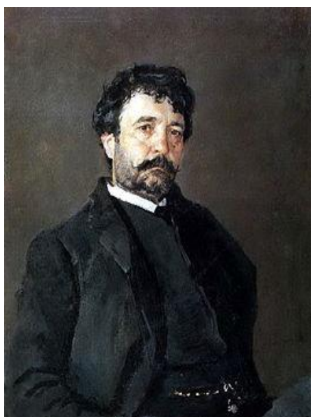
Fig. 5. V.A. Serov. The portrait of Angelo Masini. 1890. The State Tretyakov Gallery

Serov started to work on the portrait (Fig. 5) on the order of Mamontov in 1890, on the 10 th periodic exhibition of the Moscow Society of Lovers of Arts he received the first prize for this work. In the 1890s Serov achieves colour and plastic agreement in the composition, revealing the most valuable for the artist – sharpness of the characteristics. Serov's approach to the model was known in the artistic environment: to reveal the essential without hurrying, studying and peering at the person he portrayed. The artist revealed the personality of the model with an artistic appearance, capricious and accustomed to the fulfillment of his desires, amiable, sweet and courteous in the studio.