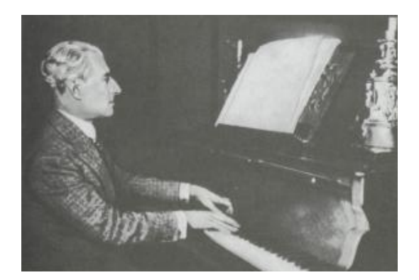
Fig. 1. Maurice Ravel'

For the first time ever Ravel addressed waltz in his piece in "Conversations Between Beauty and the Beast" from the piano suite "Mother Goose" (1908-1910). Still, to its full extent the waltz was shown in the piano cycle "Noble and Sentimental Waltz" (1911)<sup>3</sup> in which romantic traditions came alive and one can feel inner closeness towards the world of Schubert's, Chopin's and Liszt's waltzes combining a lyricpoetic expressiveness with elegance, brilliancy and virtuosity. Certain analogies with the waltz suites composed by J. Strauss II also arise<sup>4</sup>. At the same time, this music bears a distinct mark of its century. Diffusion between old and new means of the music language, combination of classical rules of formation and functional logic of the mode-tone system with the tonality principles based on dissonance and complicated