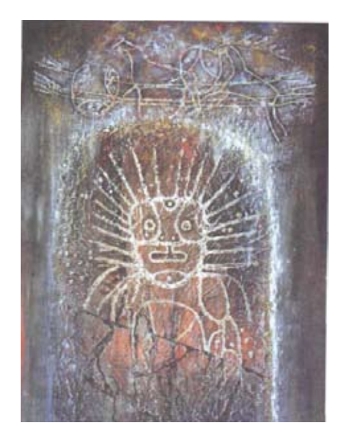
Fig. 2, 3 "The face of the Old God", 2000 and "The Turkic world. The ancient God of the Khakass"», 2001 by A.L.Ulturgashev

hunting and breeding importance in the life of the Khakass. Due to the annual change of the antlers, the deer became a symbol of renewal and rebirth. In that way, it symbolized fertility of the human and nature in general. Therefore, the appeal of the Khakass artists to the image of a sacred animal like deer has a symbolic meaning for the Khakass ethnos. It is no mere chance that the works "A horse-deer" (1990) and "The sacred deer" (1991) by A.V. Domozhakov were created during the period when the Khakass Republic declared its independence. It can be considered as the beginning of the Khakass national culture renaissance.