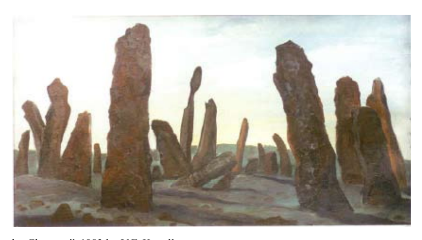
Fig. 1 "Uybatsky Chaa-tas", 1983 by V.F. Kapelko

It may be an image of mountains or some types of megalithic architecture like menhirs, single vertical stones (V.F. Kapelko "Uybatsky Chaa-tas", V.M. Novoselov "The steppe of Askiz") or cromlechs, stone slabs placed in a circle (V.M. Novoselov "The steppe of Askiz",