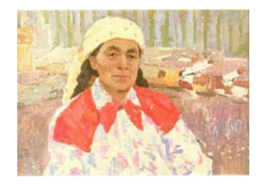
Fig. 10, 11 "The picture of a shepherd" and "The picture of the Khakass", 1975 by M.A. Burnakov