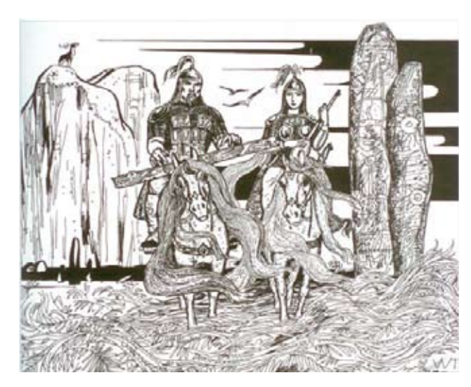
Fig. 7, 8 Series of xylograph illustrations by V.A. Todykov to the book by storyteller – hygeia S.P. Kadysheva "Ah Chibek Aryg", 1994

tambourine" (1990), "The secret relations of spirits" (1991), "The shaman" (1991) by A.V. Domozhakov, "Seeing off the shaman" (1954, 1984) by A.A. Topoev, "The dance of the shaman" (2006) by V.N. Kyzlasov and "The expulsion of the holy spirit" (1999) by A.L. Ulturgashev.