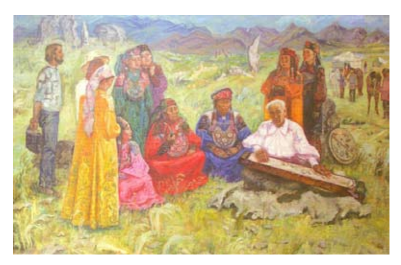
Fig. 12 "The song of Khakassia", 1987 by N.Y. Kobyltsova

cult of the sacred rock that exists in the religious world outlook of the ethnos.