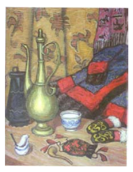
Fig. 13 "Still life with an old pitcher", 1978 by A. Z. Asachakova

still lives. There are bronze and iron pots, trays, wooden spoons, cups and bowls, leather flasks, mittens, pouches, fur coats and fabrics decorated with national ornament, and tobacco pipes. The tablecloth with national embroidery covering the table is an indispensable attribute of all her still-lives.