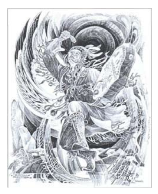
Fig. 9 "The dance of the shaman", 2006 by V.N. Kyzlasov

the portrait genre. Portrait like no other genre is intended to focus on the value and significance of a person.