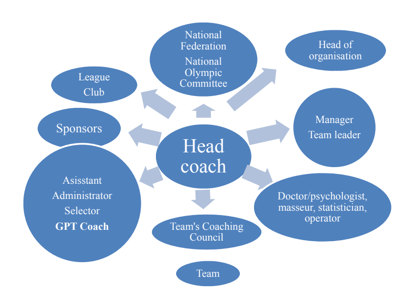
Fig. 1. Position of a coach in the overall team management system in volleyball

These definitions are more applicable and correct for the coaches who train teams of high