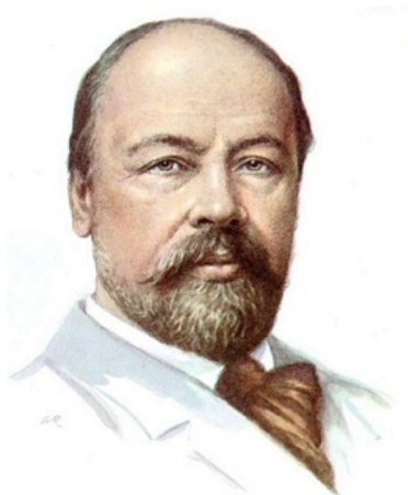
A.K. Lyadov (1855-1914)

At the turn of the 20 th century the Russian was marked with an intensive search for new language means of expression in different arts. 1 Thus, a great significance was attached to an ornament as a multidimensional phenomenon, performing its artistic, aesthetic, symbolic, styling, dramaturgical, and, sometimes even psychological functions. These features explain such a great attention to the ornament and its wide acceptance in applied and decorative arts, architecture, painting and book graphics. In that sense, artistic characteristics of ornaments were taken on board by the representatives of one of