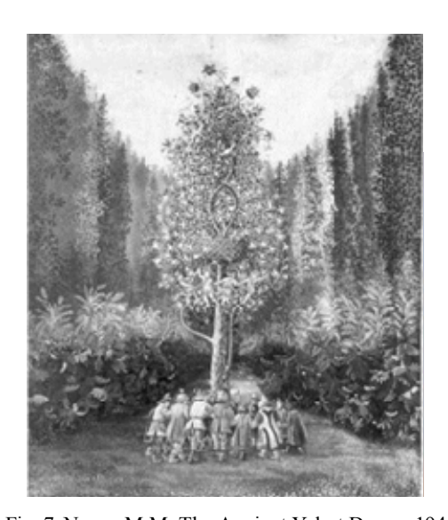
Fig. 7. Nosov M.M. The Ancient Yakut Dance. 1946