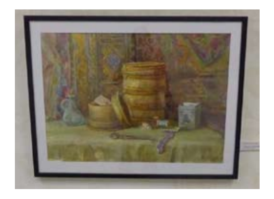
Fig. 18. Nikolaeva N.V. Needlework Accessory Boxes of Birch Bark. 2013.