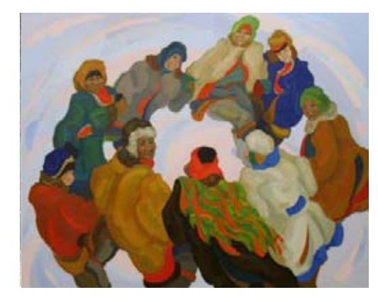
Fig. 8. Osipova A.A. The Northern Celebration. 2010

the ritual process of tying a rope around a tree trunk, which was a part of celebrating Ysyakh (traditional Yakut New Year celebration). In the central part of the triptych there is a hanging pillar with a rope tied around it. Symbolically, it expresses the idea of connection between the ethnos and the axis of the Tree of Life, the sacred centre, around which the ethnos performs its ritual round dance at the Ysyakh celebration.