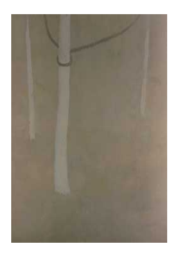
Fig. 5, 6. Lukina M.M. Triptych Ysyakh. Left part. The Old Man; Central part. The Birch. 1993