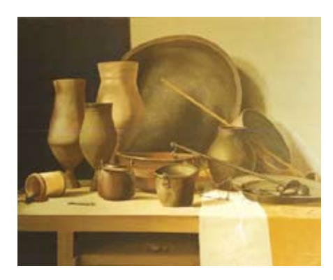
Fig. 17. Lukina M.M. Yakut Still Life with Chorons and Scales. 1998.

The technique of dissolving the boundaries of one form in another may be interpreted in the context of the modern tendencies observed in the society today. The world of a big pluralistic society acts as an integrated space of common culture, where there is no place for strict boundaries between nations. The language of a work of art, therefore, expresses the modern tendency of interpreting micro-cultures (indigenous peoples' cultures) in the space of a macro-culture. It is worthwhile mentioning, that such a tendency of shifting from certain forms to abstractionism