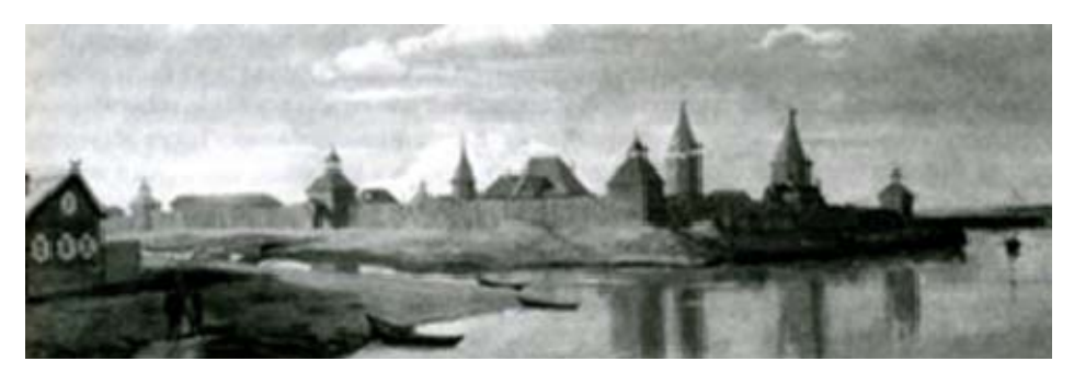
Fig. 1. Popov I.V. Yakutsk of the Late 17th Century. 1928