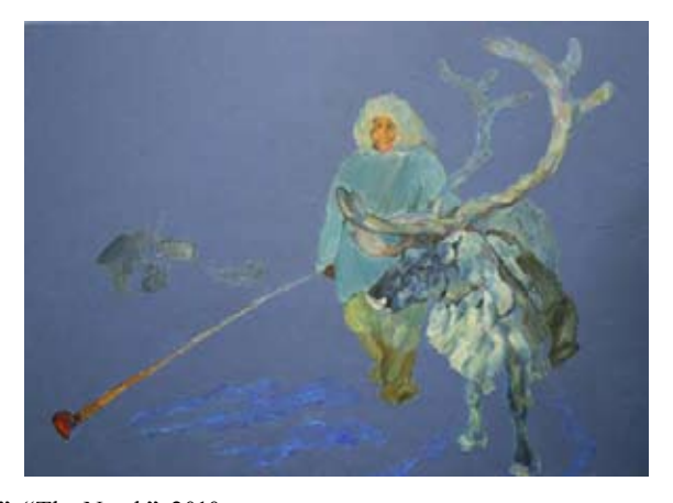
Fig. 12, 13. Osipova A.A. Cycles "The Way of Life"; "The North". 2010