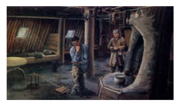
Fig. 2. Nosov M.M. In a Poor Man's Yurt. 1936

some watchtowers, resembling a Russian ostrog (fortress), an architectural construction typical for Russia of the 13 - 18^{th} centuries.