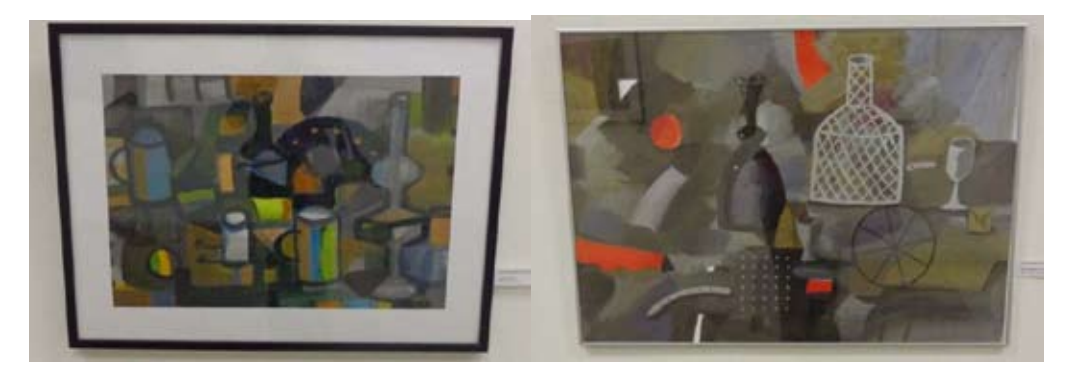
Fig. 19, 20. Shaposhnikova T.E. Still Life. 2006; Still Life with a Red Apple. 2013.