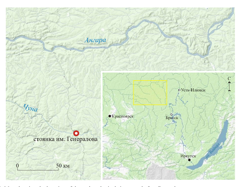
Fig. 1. Map showing the location of the archaeological site named after Generalov

At the heart of this study is an analysis of the collection of Posolskaya pottery obtained from excavations at multilayer archeological site named after Generalov (Fig. 1). The archeological site was open in 2009 by a detachment of the Irkutsk State University (S. Kogay) as part of the archaeological survey along the route of