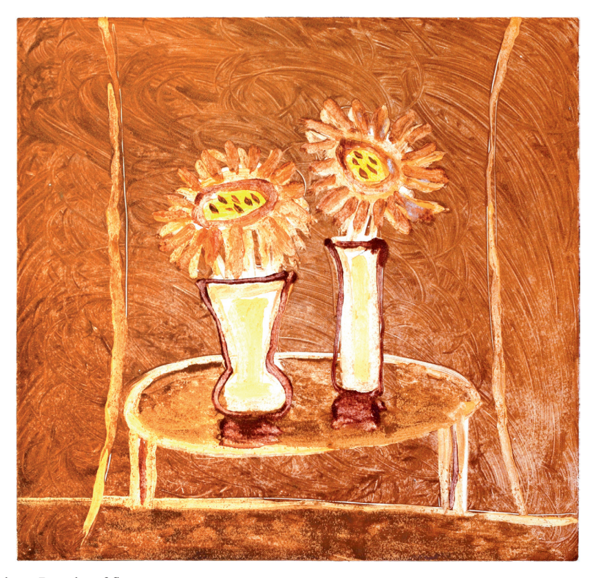
Andrey Pozdeev. Bunchs of flowers