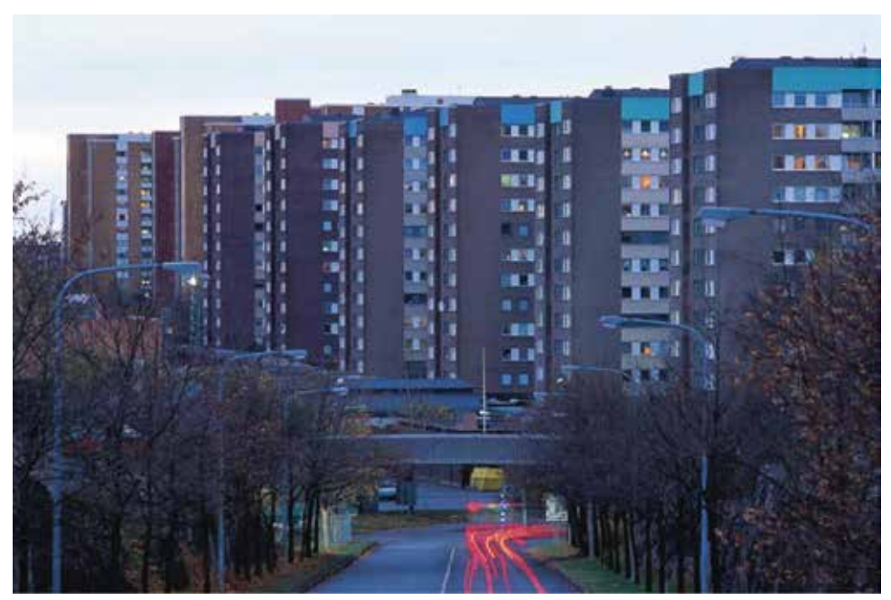
Fig. 2. The Million Homes Programme housing blocks, Stockholm, Akalla, 1998 (The Million Homes Programme, Stockholmskällan, 2020)