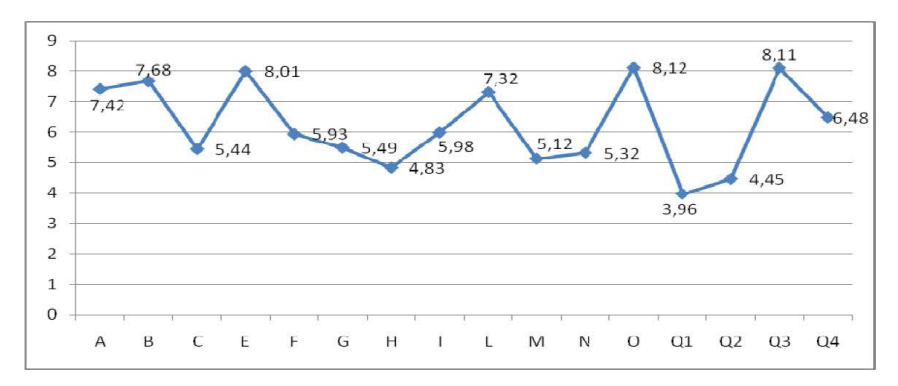
Fig. 2. Personal profile by average values

verity indicators on many scales (in scores) – C ("Emotional instability/Emotional stability" – 5.55), F ("Equanimity/Impulsivity" – 5.93), G ("Self-serving/Conscientious" – 5.49), H ("Shyness/Courage" – 4.83), I ("Heartlessness/Soft-heartedness" – 5.98), M ("Practicality/Dreaminess" – 5.12), N ("Naivety/Insight" – 5.12), Q2 ("Dependence on the group/Self-sufficiency" – 4.45).