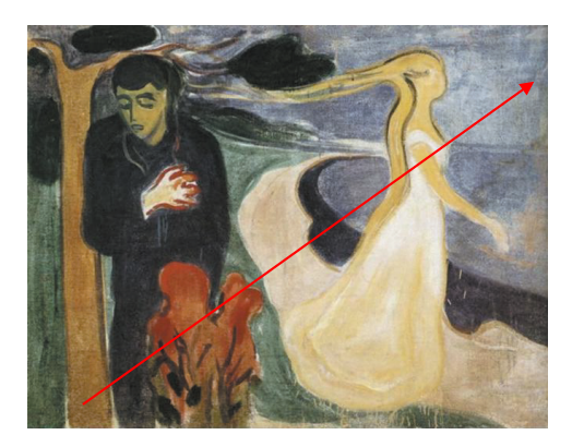
Fig. 2.1. Visualization of the characteristic of "depth" in the composition of the painting "Separation" by E. Munch

planar image to the spatial background area, which has a depth characteristic due to the symbolic value of blue. This motion is visually represented in Fig. 2.1.