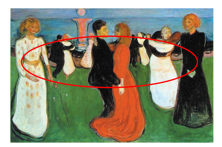
Fig. 3.1. Visualization of the compositional isolation of the painting "The Dance of Life" by E. Munch

bright color forms that make up the compositional landmarks. The rhythmicality of contrasting color forms visually makes up a compositional form of an ellipse (Fig. 3.1.), giving the artistic image a characteristic of cyclicity, infinity, isolation. The dynamics generated by a single rhythm of colorful forms, is constrained by a number of vertical elements that make up the elements of the compositional form of the ellipse. These verticals contribute to the speculative stopping of the viewer's eye in the artistic space of the picture.