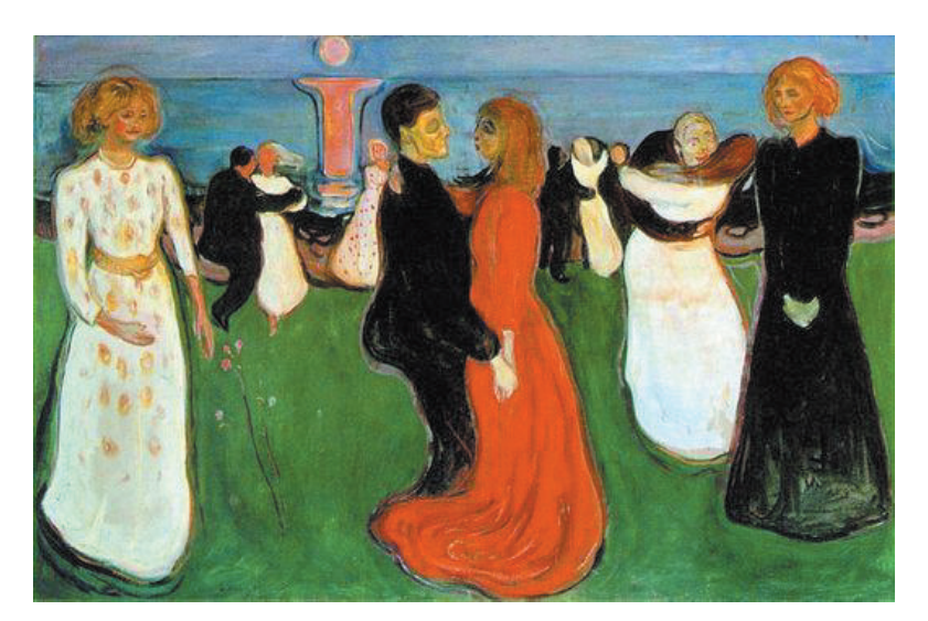
Fig. 3. E. Munch. The Dance of Life 1899–1900. Oil on canvas. 126 x 190.5 cm. National Gallery. Oslo, Norway

included in the central second section "Flowering and Passing of Love" of "The Frieze of Life" cycle. E. Munch has several paintings with this name. In particular, these are canvases of 1921 and 1925. The painting chosen for the philosophical and art analysis is one of the earliest and key pictures in "The Frieze of Life" cycle.