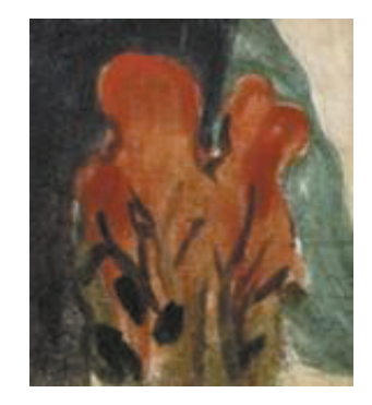
Fig. 2.2. Fragment of the painting "Melancholy"

The artistic sign of the generalized silhouette of male and female figures is presented in the foreground of the painting, covering the character's leg (Fig. 2.2). This