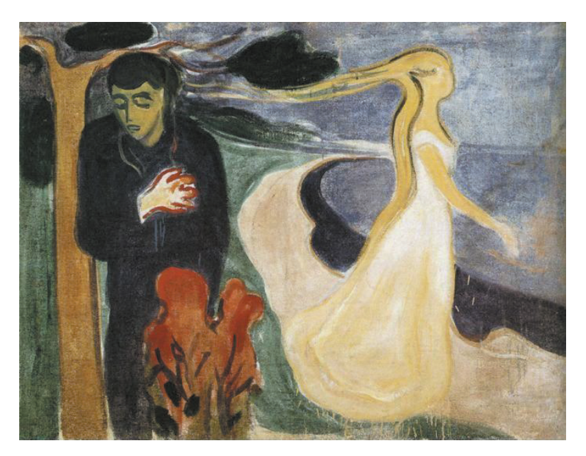
Fig. 2. E. Munch. Separation. 1896. Oil on canvas. 96.5 x 127. Munch Museum. Oslo

The color zones of the painting are represented by colorful strokes of white, black, red, green, blue, yellow. With the dominant role of rich dark colorful zones, the luminous function of white and yellow colors is emphasized. In their symbolic meaning, these colors acquire the functions of luminescence and lumen.